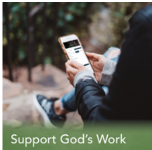
Support God's Work

Meet others in their 20s wanting to grow in their faith. Learn more here .