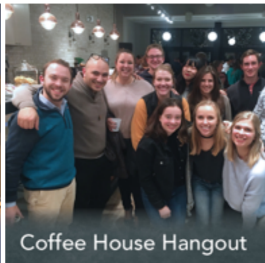
Coffee House Hangout

Learn more about the heart of our church. Register for Meet the Pastor here .